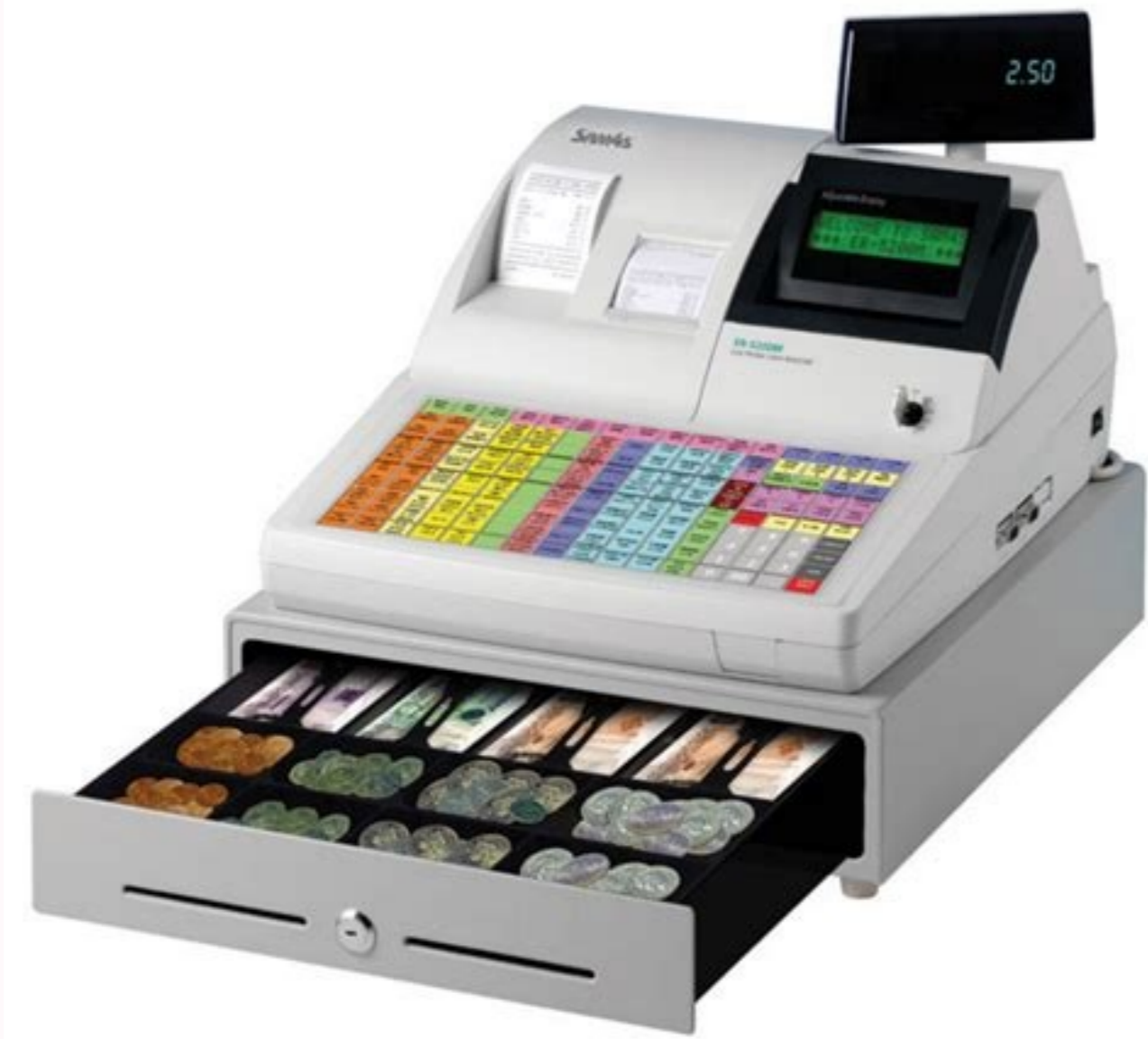
Casio cashier machine manual.